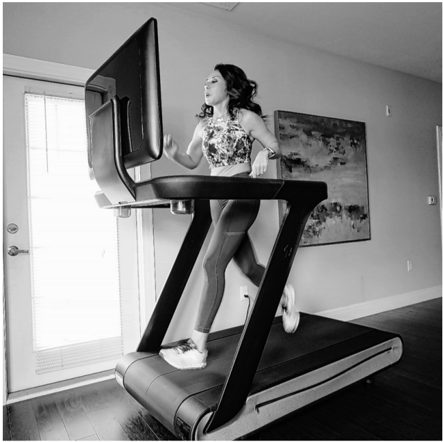
Peloton is feeling the pressure as rivals become more competitive.

expects to have 3.35 million to 3.45 million subscribers at the end of June, down from an earlier target of 3.63 million. It now forecasts $4.4 billion to $4.8 billion in annual revenue, down from $5.4 billion. Peloton has overhauled its manufacturing and supply chain after it experienced major shipping delays during the pandemic. A high-profile recall fight with U.S. regulators led the company in May to halt sales of its Tread+ treadmill, which has yet to return to market. The Tread+ was recalled after a child was pulled under one of the machines and killed. Subsequently, the company and U.S. safety regulators learned of other cases of children and pets getting injured in the same manner. The company has restarted sales of another treadmill.