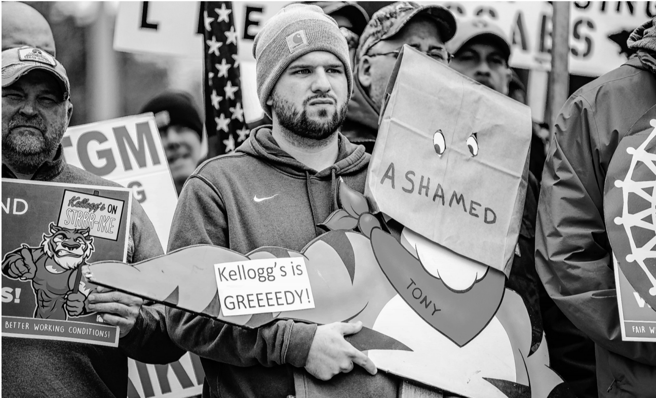
More than 1,000 employees walked off the job at Kellogg’s U.S. cereal plants. A rally supporting strikers at its headquarters last week.

A monthlong strike at Kellogg Co. is raising the cereal company’s costs as it contends with inflation and supply-chain disruptions. More than 1,000 employees walked off the job at Kellogg’s U.S. cereal plants last month, objecting to the company’s proposals during contract negotiations regarding holiday and vacation pay, retirement benefits and healthcare, according to the union representing the workers. The cereal and snack maker behind Pop-Tarts, Frosted Flakes and Rice Krispies said Thursday that it expects supply-chain bottlenecks and shortages to continue in coming months, boosting costs as the strike aggravates existing difficulties. “There is no question that today’s business environment is as challenging as we’ve ever seen it,” said Chief Executive Steve Cahillane. Michigan-based Kellogg is among the major U.S. companies where employees are demanding higher pay and expanded benefits as labor shortages persist across industries from food to manufacturing. Union officials have said workers’ wage and health concerns deepened over the course of the Covid-19 pandemic, and some labor leaders have said they see an opportunity to organize more workplaces. Critics have said strikes and other worker demands risk pushing